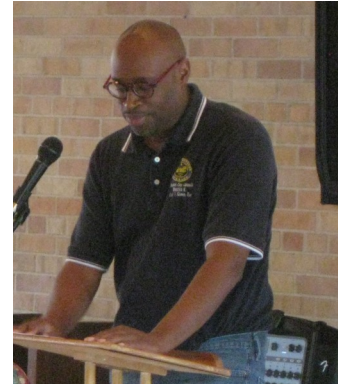
At Linkwood Annual Meeting May 2018