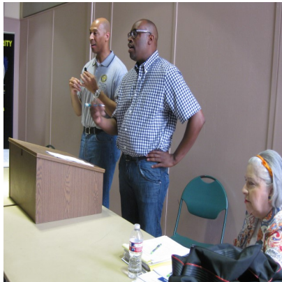
At Linkwood Annual Meeting April 16